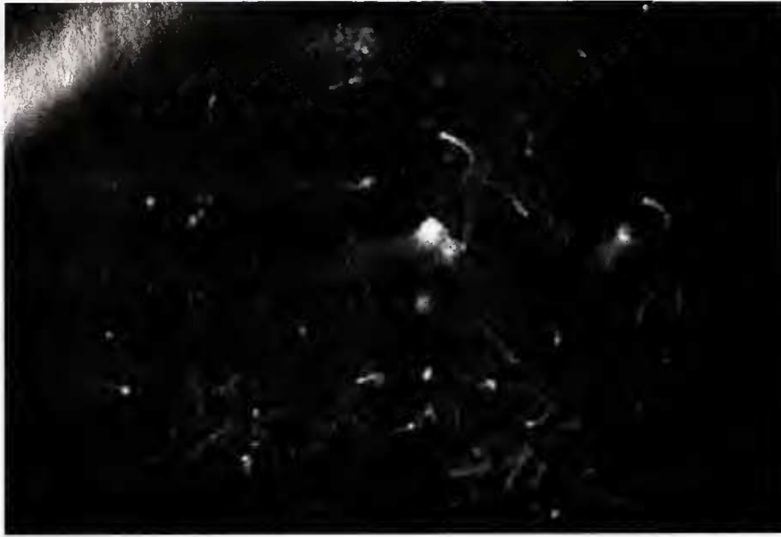
Figure 4. Frame grab from a low-light video recording showing the release of glowing particles from the arm tips of Vampyroteuthis infernalis . The head of the specimen is directed toward the camera. Particles in the cloud are swirled by movements of the arms and web, and by water jetting through the siphon. "Tails" on the glowing particles are caused by electronic lag in the camera's image intensifier.

the tip lights was negative, as were the culturing efforts to demonstrate the presence of luminous bacteria in the arm tips and their exudate.